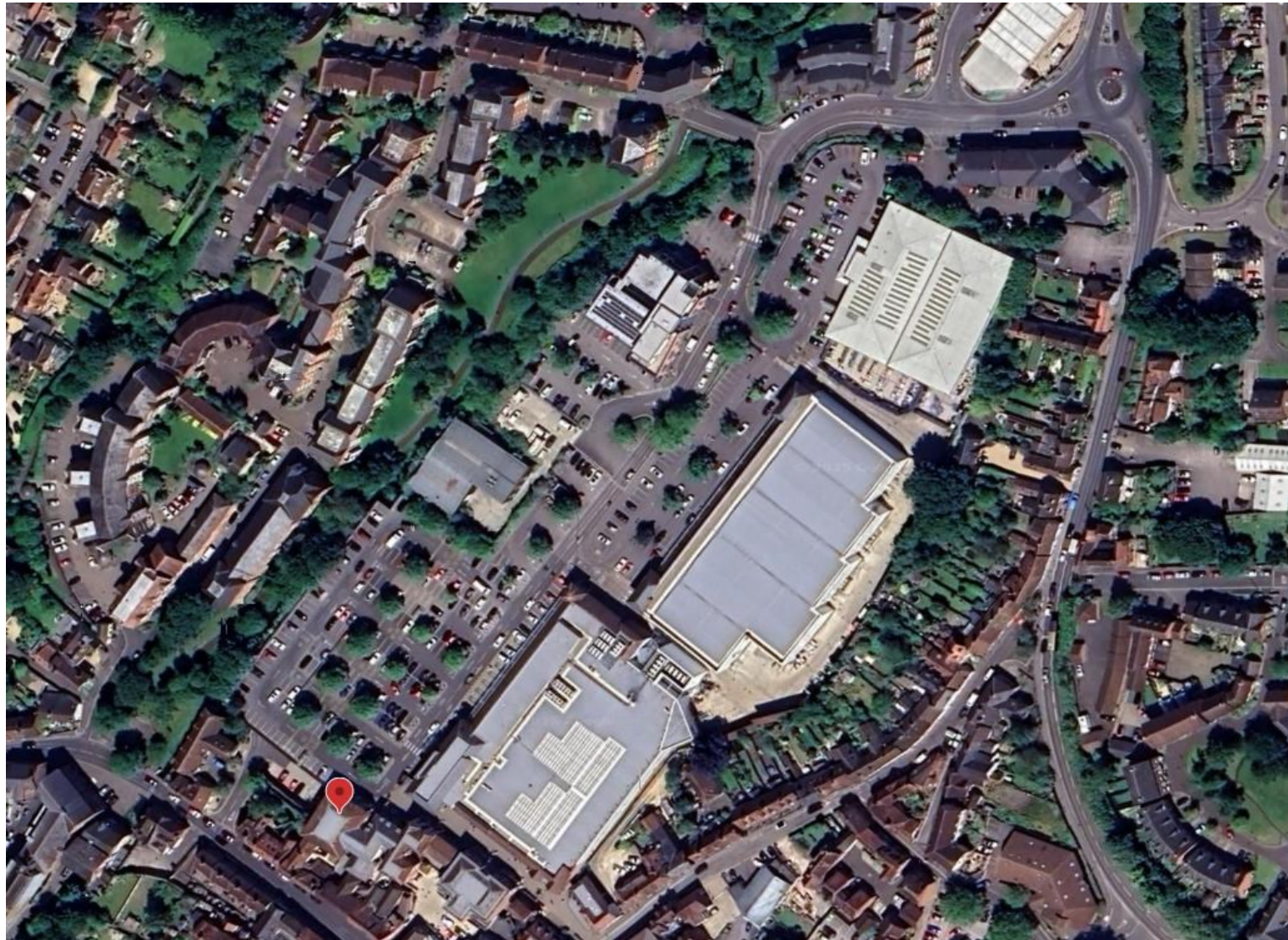
Unit 7, Kings Park Shopping Centre, Wantage OX12 9AJ

TO LET Large retail unit with basement on Kings Park Shopping Centre, Limborough Rd, Wantage in southern Oxfordshire.